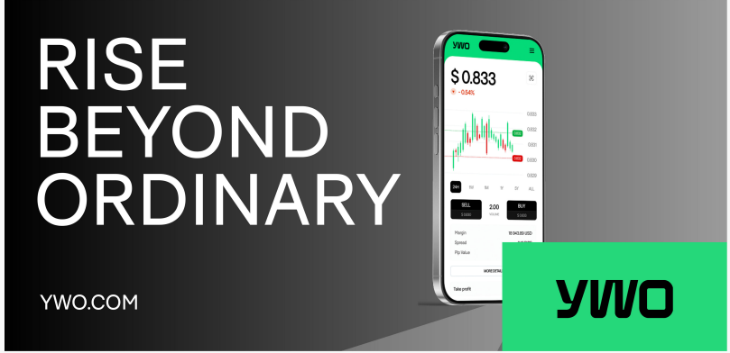
Beyond the Ordinary