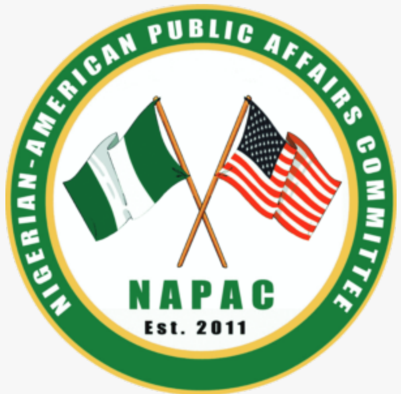
NAPAC USA Logo