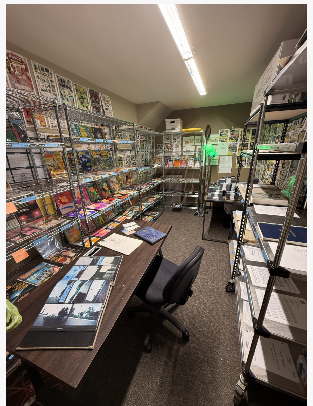
A portion of the largest UFO broadcast library set for auction on December 13th.

• Stanton Friedman: The nuclear physicist credited as the "Father of Roswell" and crash retrieval