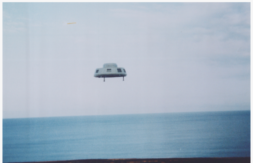
A local took this UFO picture as it emerged from undersea and began moving towards the beach, 1993 Maslin Beach, Australia.