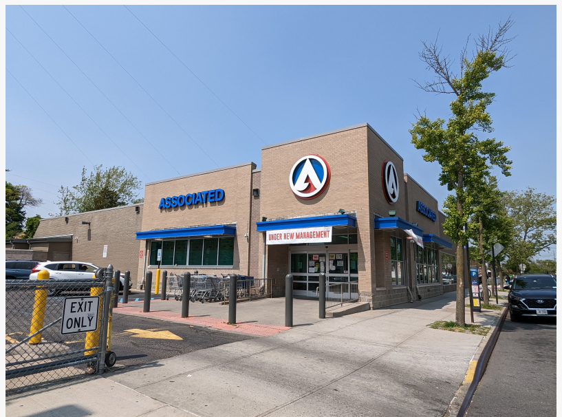
the Rosedale store operated by ASG