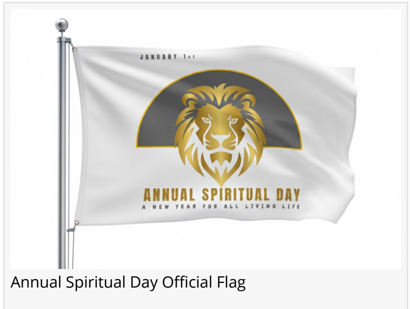
Annual Spiritual Day Official Flag