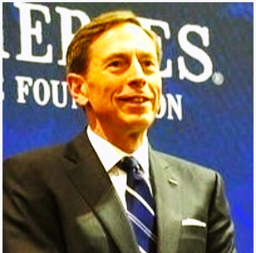
General David H. Petraeus (U.S. Army, Ret.)

This press release can be viewed online at: https://www.einpresswire.com/article/863742263 EIN Presswire's priority is source transparency. We do not allow opaque clients, and our editors