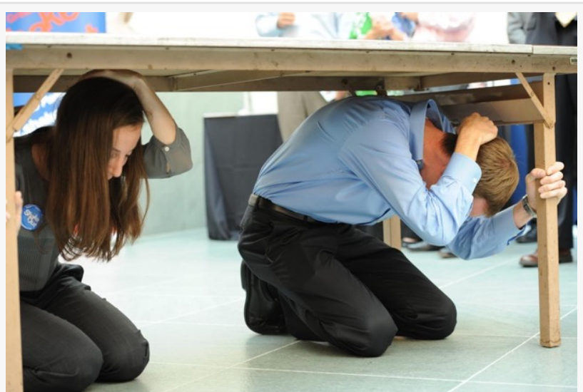
Adults practicing "Drop, Cover, and Hold On" beneath a table