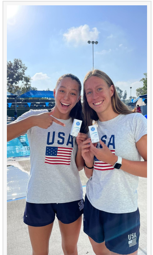
USA Olympic Swimming Team Showcases Ear Pro, Their Go- To for Ear Protection

This press release can be viewed online at: https://www.einpresswire.com/article/854294339