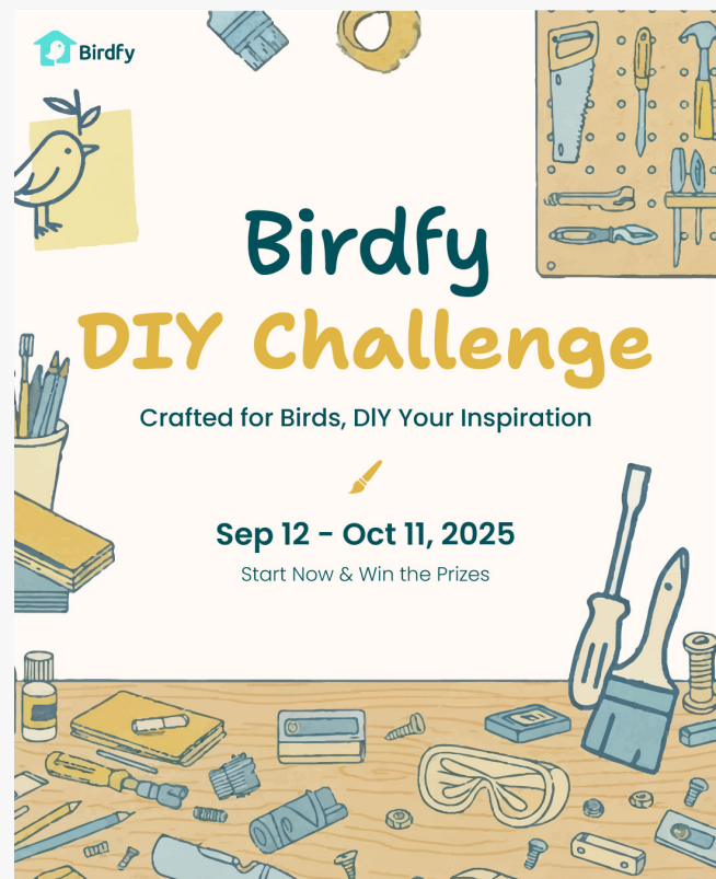
Birdfy DIY Challenge