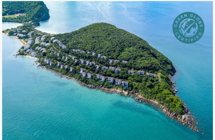
Premier Village Phu Quoc Resort

Since opening, Premier Village Phu Quoc Resort has implemented a series of long-term,