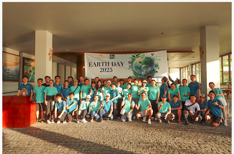
The Premier Village Phu Quoc Resort Team take part in Earth Day celebrations.

Premier Village Phu Quoc Resort proudly organizes environmental initiatives that benefit the local environment and community. Each quarter, over 40 Heartists (aka voluntary staff members