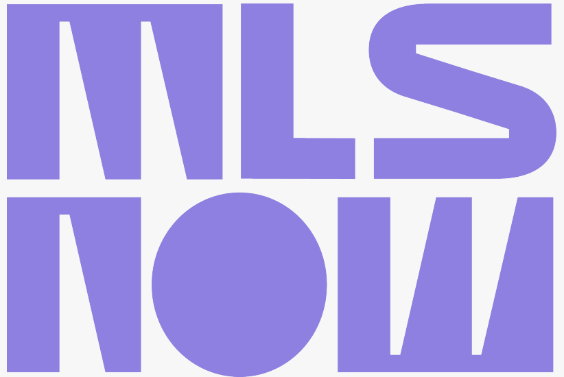
MLS Now Primary Logo

INDEPENDENCE, OH, UNITED STATES, September 8, 2025 /EINPresswire.com/ -- MLS Now, the multiple listing service serving 32 counties across Ohio, today unveils a bold new brand identity that signals a fresh vision for the future of real estate. Developed in collaboration with 1000watt, a leading creative agency specializing in real estate branding, the transformation represents more than a new look—it positions MLS Now as a modern, innovative, and Broker-first MLS, built to meet the demands of today's market and anticipate those of tomorrow.