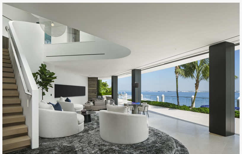
JBL Synthesis Theater & Smart Home with Floor-to-Ceiling Bay Views

As part of Sotheby’s Concierge Auctions’ Key for Key® giving program in partnership with Giveback Homes, the closing will result in funding towards new homes built for families in need.