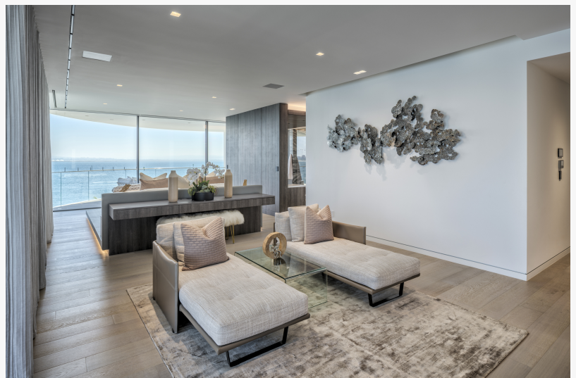
Seven Bedrooms with Private Balconies and Eleven Luxury Bathrooms

This press release can be viewed online at: https://www.einpresswire.com/article/846537953