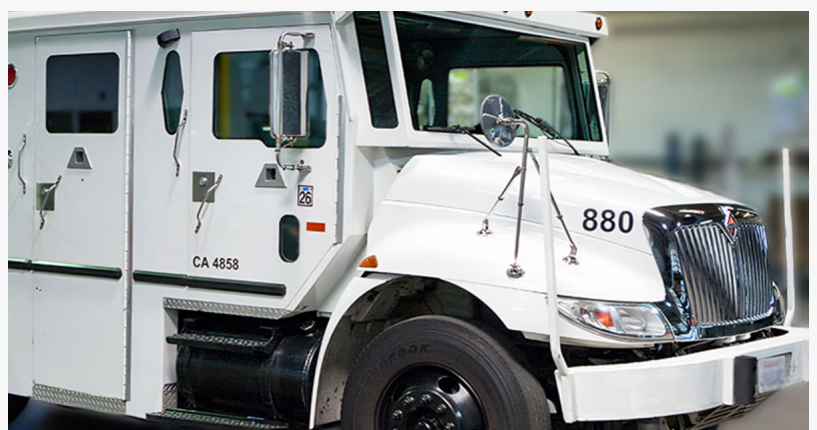
Armored Transportation Services for Banks

Drivers, dispatchers, and client staff stay in constant communication. This ensures everyone knows where the money is and can respond quickly to unexpected events. Tracking and reporting give banks a clear picture of their funds at all times. The services are designed to work with the bank's daily operations while keeping money secure.