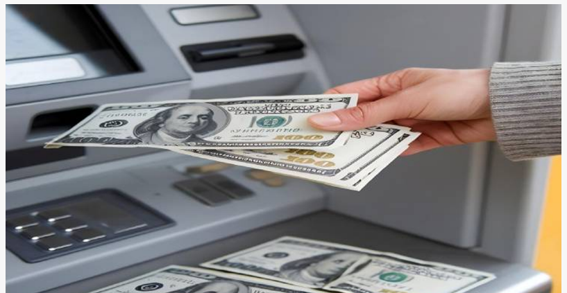
ATM & Self-Service Kiosk Support Services