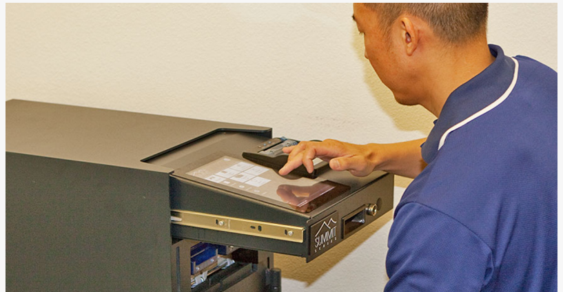
Smart Safe Installation and Maintenance Services

Transporting cash involves several steps. Staff plan the route carefully, follow secure loading and unloading processes, and keep detailed records.