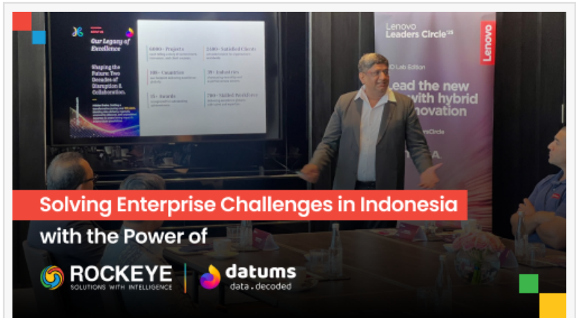
Solving Enterprise Challenges in Indonesia with the power of ROCKEYE and Datums AI