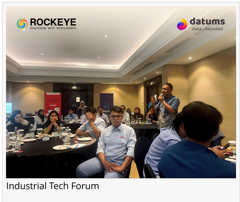
Industrial Tech Forum

These productive and insightful sessions focused not on massive overhauls, but on how a strategic addition of AI-powered tools can unlock significant efficiency and growth. From healthcare to oil & gas, from fintech to manufacturing, businesses across sectors participated.