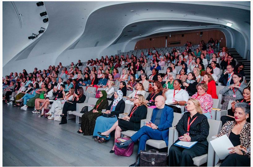
The GCC Menopause Summit 2024 Audience