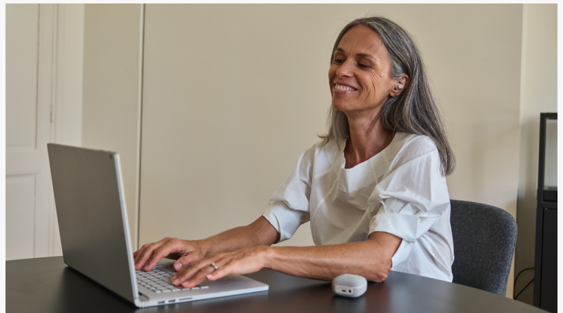
Wave Lite Aux-in & Bluetooth