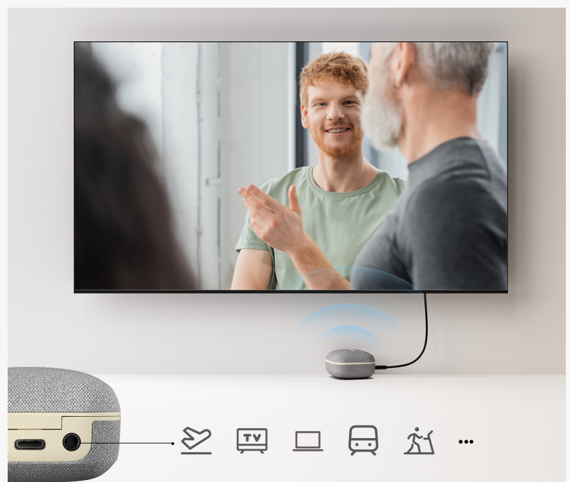
Wave Lite Aux-in feature