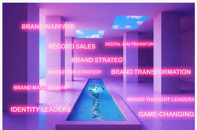
SXTC-DYADICA Global Brand Consulting Top 1% Crunchbase rating

"This Crunchbase score isn't just a milestone—it's a reflection of the reputation we've built," says Esteban. " SXTC Global Brand Consulting and DYADICA have never been about following competitors and being part of a market offering. We've spent 30+ years designing the future of