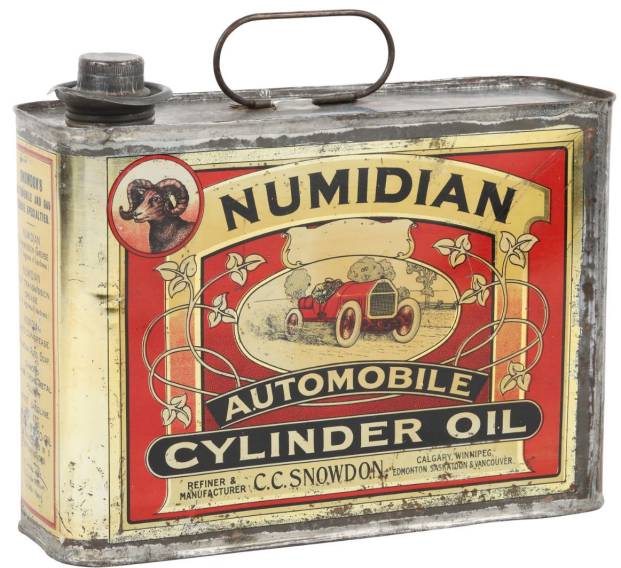
Circa 1920s Canadian two-sided lithographed tin from around the 1920s for C.C. Snowden Numidian Automobile Cylinder Oil, with a graphic of a race car (estimate: CA$12,000-$15,000).

Mr. Miller added, "September 14 features exclusively the Don Titherington collection of general store advertising. For decades Don slowly built a world-class collection often upgrading multiple