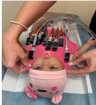
Vest applied to infant

Without the EZ Pedi EKG Vest, pediatric EKG testing often remains inconsistent, labor-intensive, and stressful for patients. Missed or inaccurate readings can delay diagnoses of critical cardiac conditions, while the complexity of the procedure may discourage routine preventative screenings. By integrating precise electrode placement into a single, easy-to-apply vest, this device addresses these limitations to improve both clinical outcomes and the patient experience.