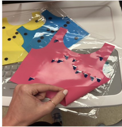
Rear view of vest and its components