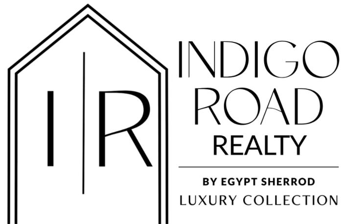
Indigo Road Realty Luxury Collection

Each enclave is designed for discerning buyers seeking privacy, natural beauty, and architectural distinction. With homesites ranging from 2 to 12 acres and starting prices from $1 million, these developments offer a rare opportunity to build legacy estates,