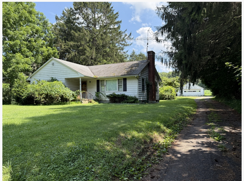
Cape Cod House on .61+/- Acres