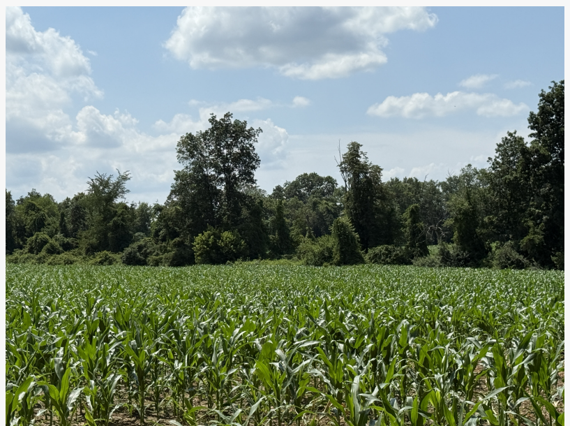
Rich Soils of Musconetcong River Valley