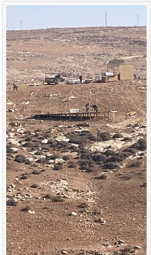
Structures put by Illegal Settlers on The Confiscated Land

This egregious land seizure mirrors the broader crisis of forced displacement in other areas in the South Hebron Hills, powerfully depicted in the Oscar-winning documentary No Other Land . The film chronicles years of settler expansion, demolitions, and violent expulsion of Palestinian villagers under the watch, and often protection, of the Israeli military. Masafer Yatta is one of the most prominent flashpoints in that struggle.