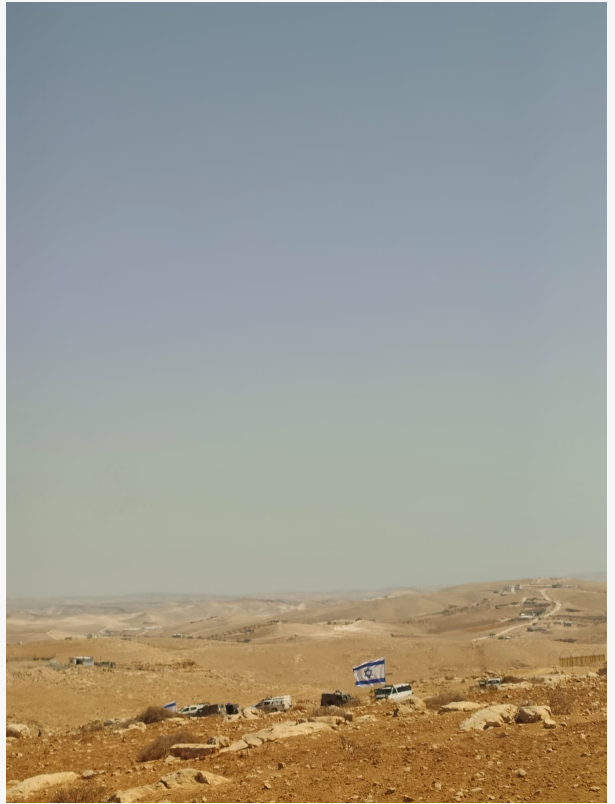
Israeli Flag put by Illegal Settlers on The Confiscated Land