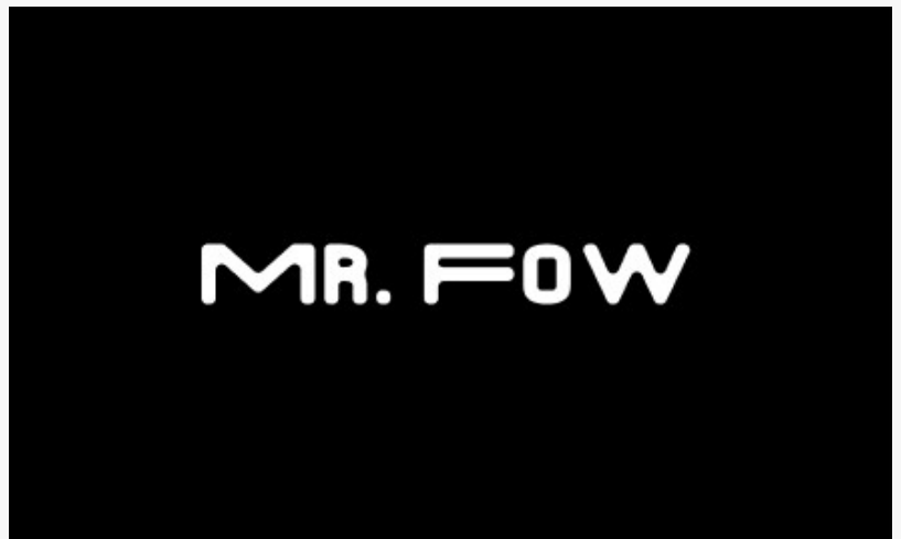
Mr. FoW is a workplace of the future and future of work visionary and champion

This press release can be viewed online at: https://www.einpresswire.com/article/841539736