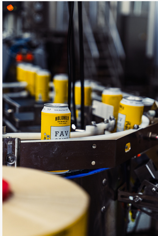
Holidaily crafts award-winning beer using premium ingredients in a certified 100% gluten-free facility.

Holidaily Brewing Company, founded in 2016 in Golden, Colorado, has experienced consistent year-over-year growth and is now the country's leading dedicated gluten-free craft brewery. Built on a mission to deliver exceptional beer without compromise, Holidaily has transformed what it means to drink gluten-free. The brewery's flagship beer, Favorite Blonde, is the #1 selling gluten-free beer in the U.S., and alongside Fat Randy's IPA, represents the top two fastest growing gluten-free brands nationwide.