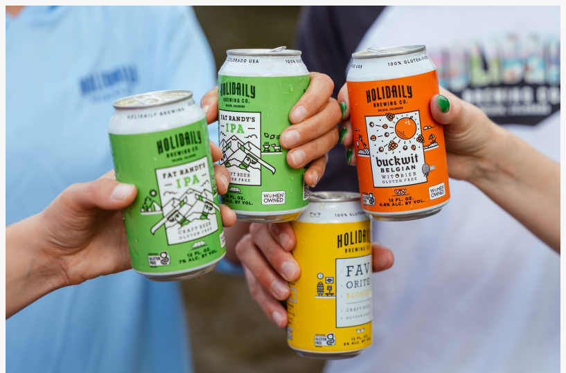
Cheers to 100% gluten-free, 100% great tasting beer from Holidaily!

Holidaily's remarkable growth has been driven by strong partnerships with major retailers like HEB, Total Wine, Safeway Whole Foods, Sprouts, and Trader Joe's, bringing gluten-free craft beer