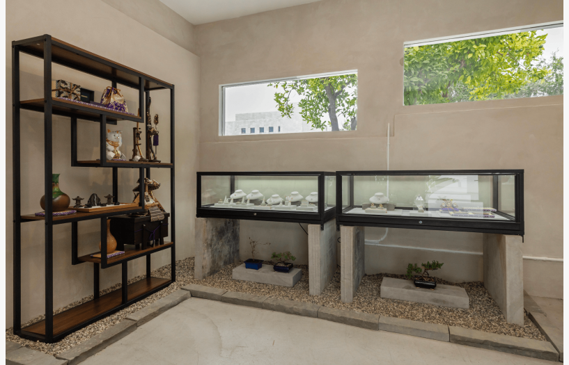
KIMITAKE Boutique Beverly Hills Interior

Each decorative element serves not merely as an embellishment, but as an extension of the brand's storytelling. For example, ichirin-zashi single-stem vases made of Shigaraki ware, a traditional ceramic craft from the same region as KIMITAKE's signature Samurai Braided Cord, symbolize the enduring connection between the jewelry and Japan's centuries-old artisanal