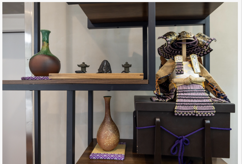
KIMITAKE Boutique Beverly Hills Interior

For this new chapter, KIMITAKE has chosen Beverly Hills, the global capital of luxury. Here, the brand presents the uniquely Japanese sensibilities of tranquility and wabi-sabi in a contemporary, refined expression.