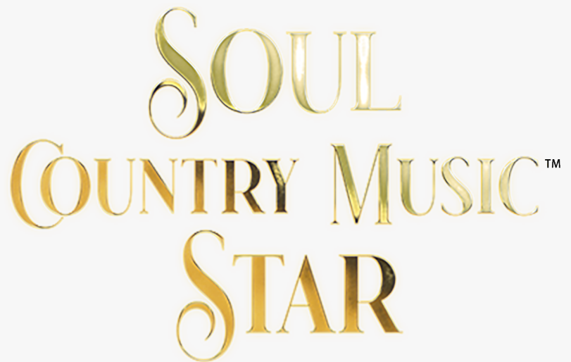
Soul Country Music Star logo