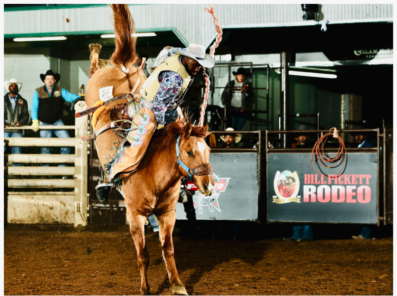
BPIR Fort Worth, TX Bronc Rider

Audiences are invited to experience two dynamic performances at 1:30 PM and 7:30 PM, each showcasing elite Black cowboys and cowgirls in a thrilling display of rodeo sport, cultural pride, and community unity. Fans can expect thrilling competitions in bull riding, steer wrestling, ladies