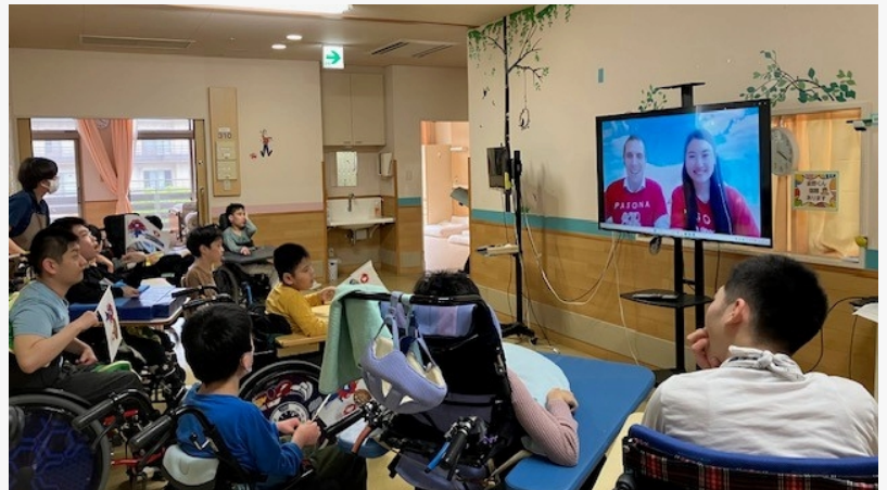
First iteration of the "PASONA NATUREVERSE Online Field Trip"

To tackle this, the "Social Contribution