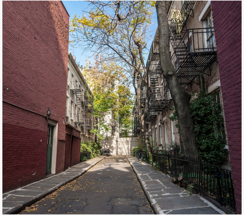
Patchin Place.