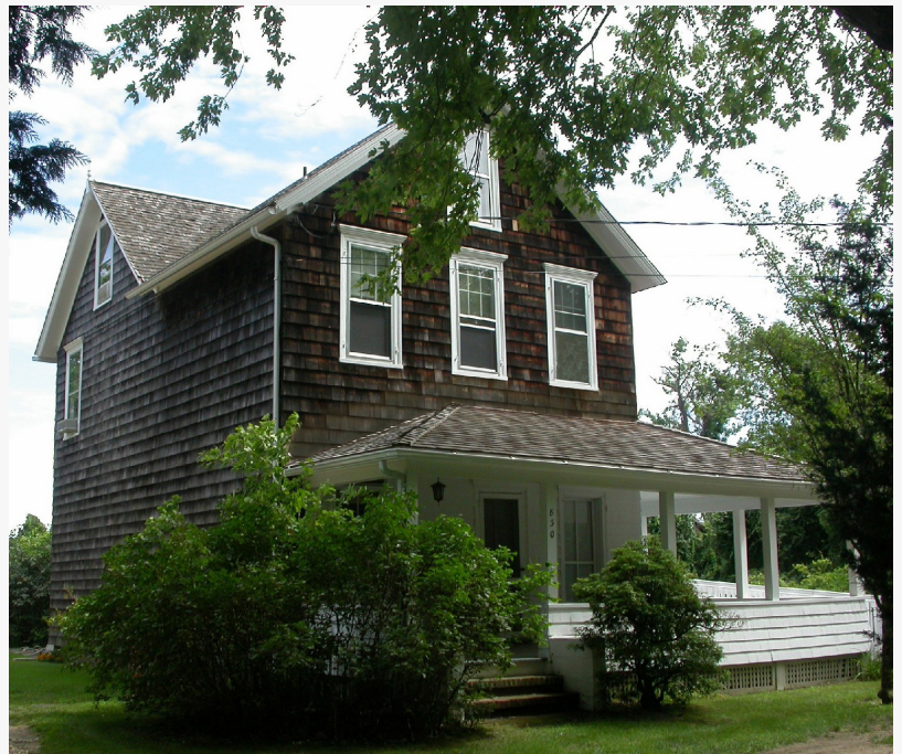
Pollock-Krasner House.