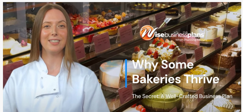
Bakery Business Dream

The American workplace is in transition. While some chase elusive promotions or navigate uncertain layoffs, others are choosing to leave the corporate maze behind in search of something more authentic. According to the U.S. Census Bureau, new business applications