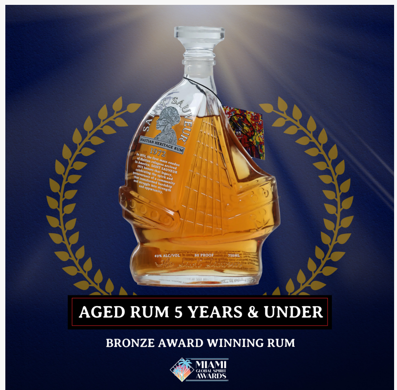
Saint Sauveur 1972 - Bronze Aged Rum 5 Years and Under Winner at Miami Global Spirits Awards