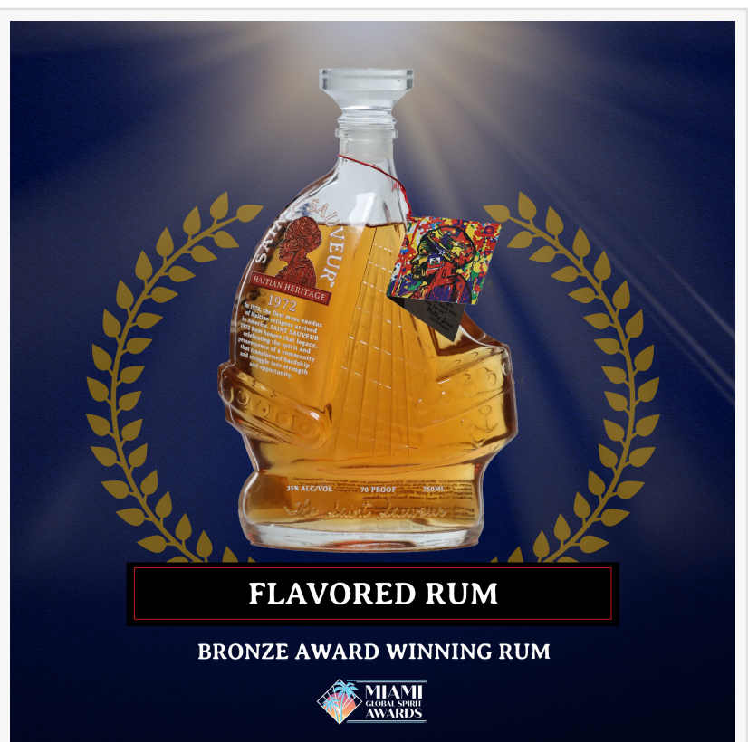
Saint Sauveur 1972 - Bronze Flavored Rum Winner at Miami Global Spirits Awards