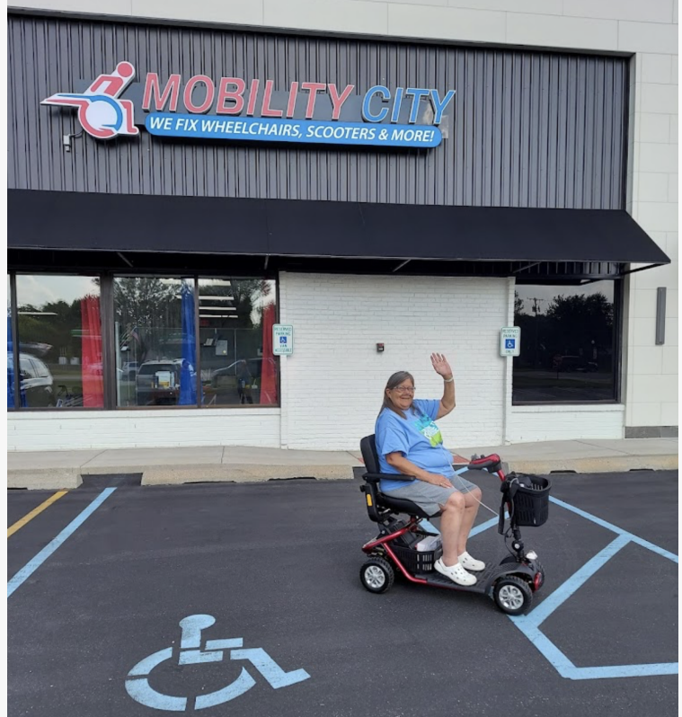
Storefront Mobility City of Southfield located at 26732 Southfield Rd, Lathrup Village, MI 48076, TEL 248-234-5020

Veterans and their families in Southeast Michigan can call (248) 617-0547 to schedule a service appointment or learn more about Mobility City's complete range of mobility solutions.