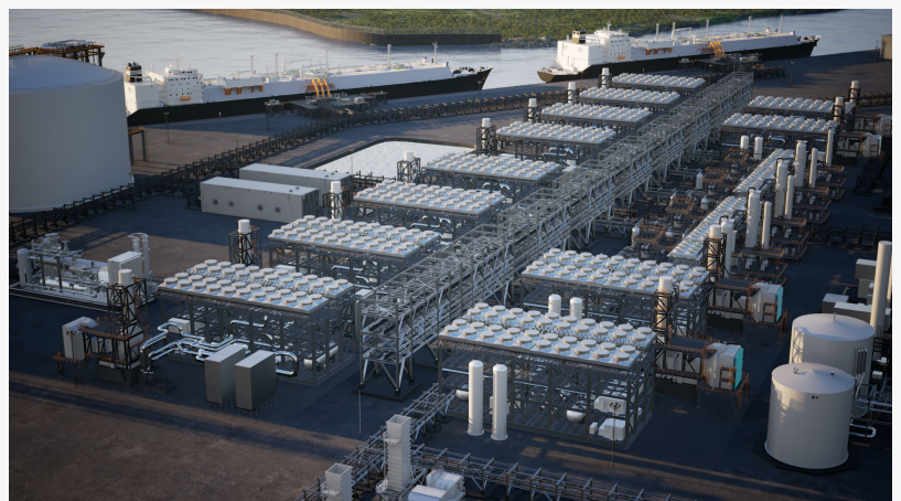
Proposed project targets approximately 24 million tons per annum (MTPA) of production capacity