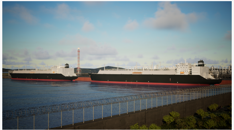
Argent LNG Ships