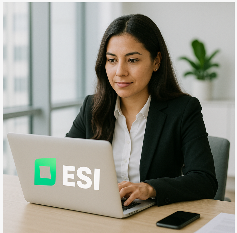
best peo for medium sized businsses 2026

AUSTIN, TX, UNITED STATES, August 11, 2025 /EINPresswire.com/ -- Yuna Health, a leader in AI-powered mental health coaching, has partnered with ESI PEO, a trusted professional employer organization, to deliver a seamless solution that blends innovative mental health support with comprehensive HR services. Yuna's enterprise-grade platform provides employees with instant, private access to AI mental health coaches, helping them manage workplace stress and burnout without the barriers of traditional therapy. Combined with ESI's expertise in payroll, compliance, and benefits administration, this collaboration empowers businesses to create healthier, more productive workforces while simplifying HR operations. This partnership sets a new benchmark for addressing employee well-being and operational needs in today's fast-paced workplaces.