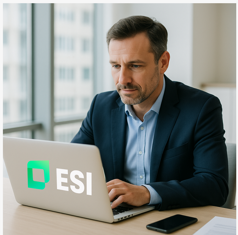
best peo for small businesses 2026

ESI PEO provides HR outsourcing solutions for small to mid-sized businesses, specializing in payroll processing, benefits administration, workers' compensation, and compliance support. With a focus on high-