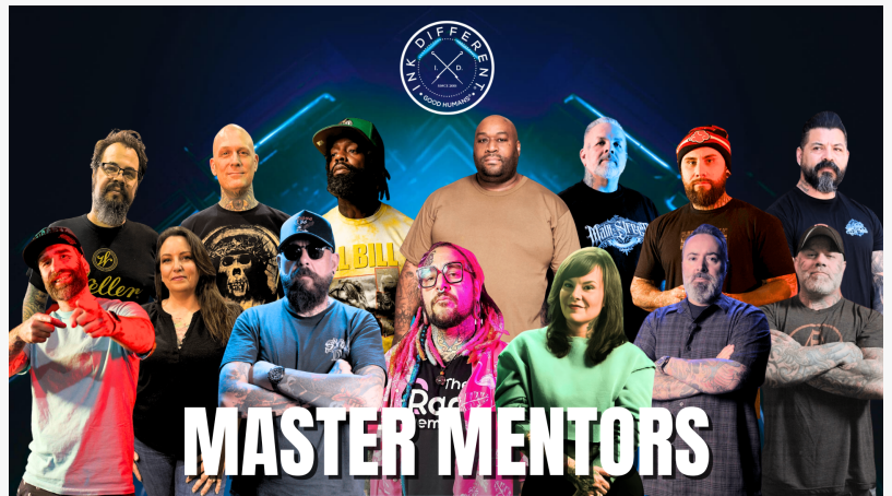
Ink Different Tattoo's Master Mentor Team

HOLLYWOOD, FL, UNITED STATES, July 10, 2025 /EINPresswire.com/ -- Ink Different Tattoos is thrilled to announce its 14th anniversary this July, realizing nearly a decade and a half of empowering the craft of tattooing through high-standard, inclusive apprenticeships, shop ownership, empowering other shop owners, and the creation of the Master Mentorship Program with celebrity Tattoo Artists nationwide.