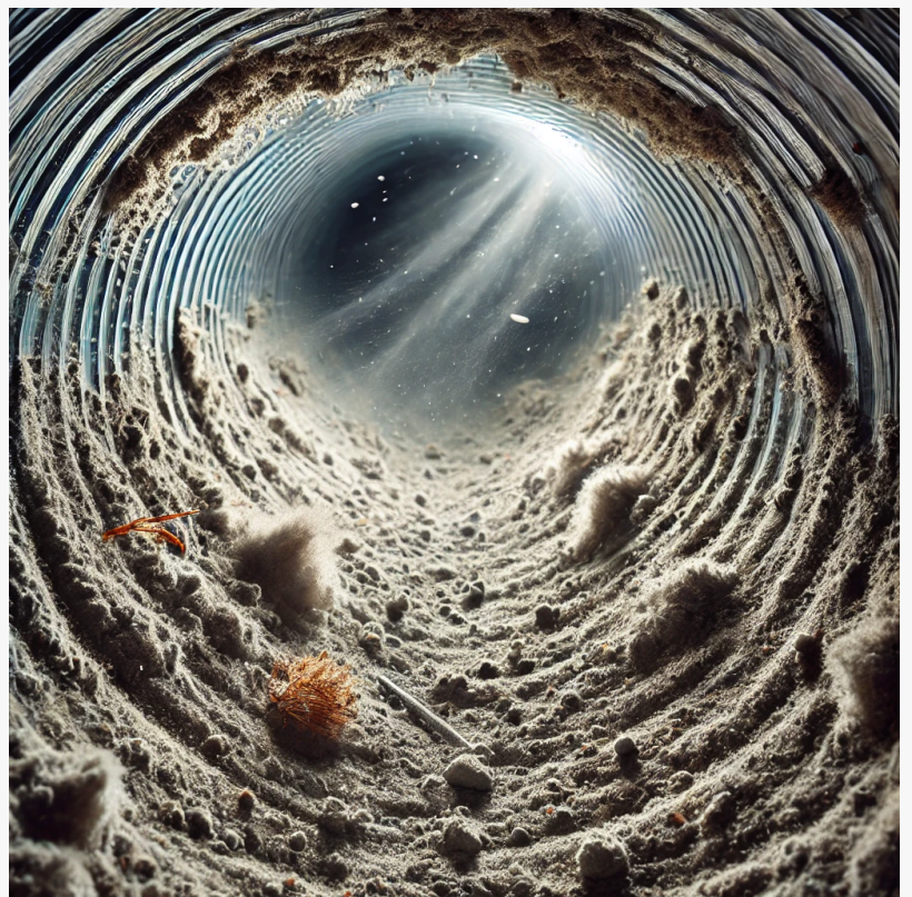
Inside Dirty air Duct

- Do Not Disturb Contaminated Areas:** Avoid sweeping or vacuuming rodent waste, which can send harmful particles into the air.