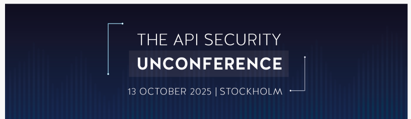
Nordic APIs API Security UnConference