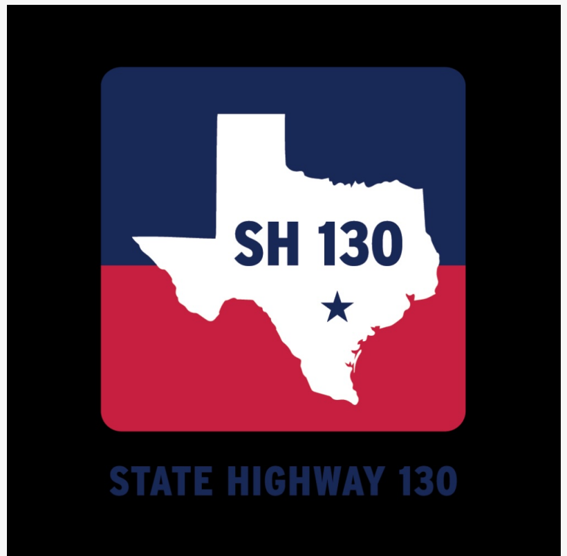
Texas State Highway 130 Logo