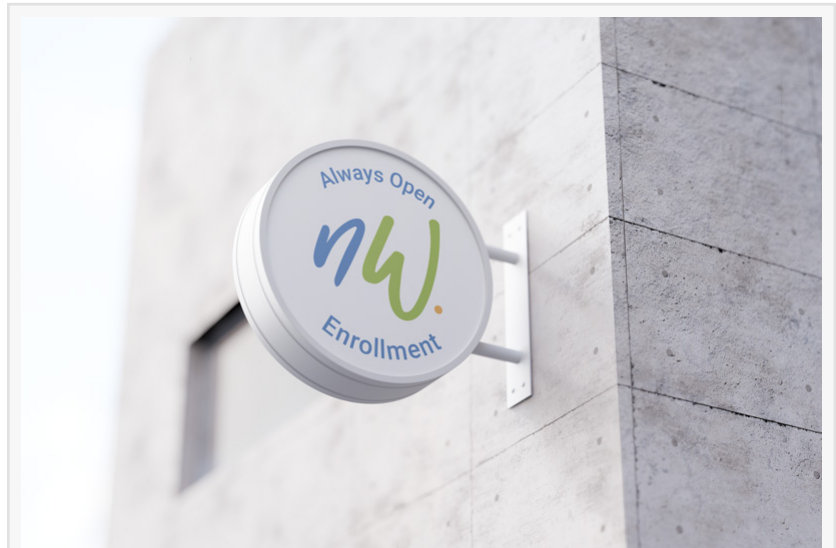
netWell - Always Open Enrollment

AUSTIN, TX, UNITED STATES, June 13, 2025 /EINPresswire.com/ -- In a healthcare system where over 80% of medical bills contain errors and the national medical debt burden has surpassed $220 billion, many Americans are turning to bill negotiators and advocacy services to prevent financial collapse from hospital charges. Among the organizations leading this change is Goodbill, whose partnership with health care sharing ministry netWell™ is making a significant real-world impact on families across the country.