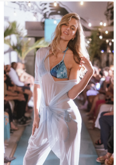
Miss Nicaragua and Belleza Tropical Swimwear

This press release can be viewed online at: https://www.einpresswire.com/article/821453027