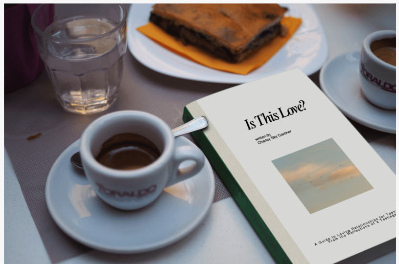
Is This Love? paperback