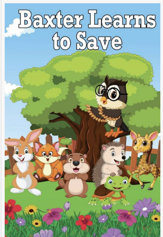
Baxter Learns to Save

This press release can be viewed online at: https://www.einpresswire.com/article/816937308