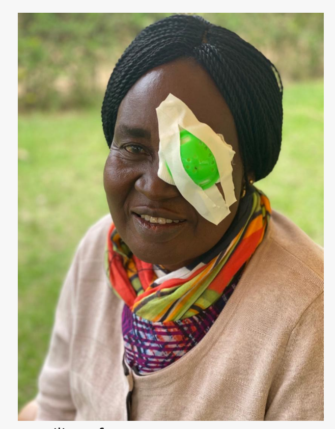
Women smiling after cataract surgery

transformation, and empowers local communities for long-term impact.