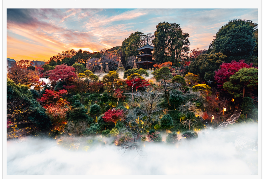
The Tokyo Sea of Clouds at Hotel Chinzanso Tokyo (best time to view fall colors: November–December)

over 10 million arrivals in the first quarter of 2025 alone according to the Japan National Tourism Organization, Hotel Chinzanso Tokyo offers travelers an opportunity to engage in authentic,