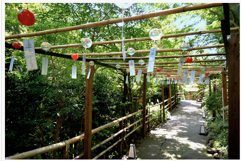
Wind chimes in Chinzanso Garden during the summer season (July to September)

"Through our 'Seven Seasons,' we invite guests to experience not only the beauty of nature but also the spirit of