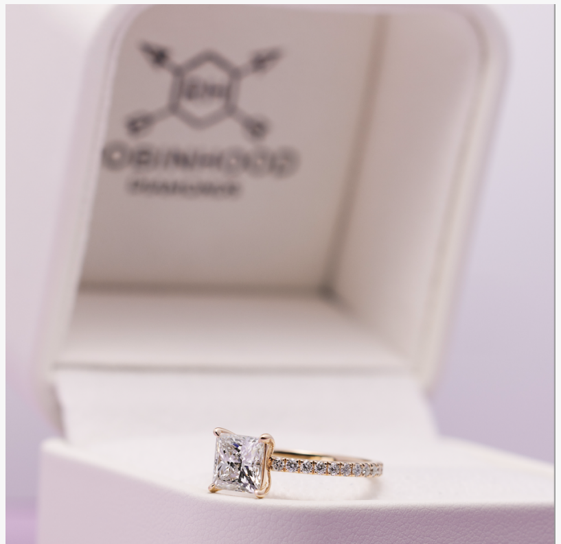
A RobinHood Diamonds engagement ring is just the first in a couple's life....)

The 10-year guarantee allows existing RobinHood Diamonds customers to return to receive an additional diamond of comparable size and quality to their original engagement ring purchase at no cost when they welcome their first baby .