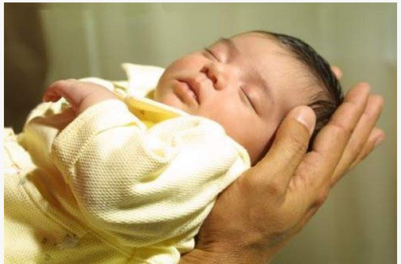
A Safe Haven for Newborn baby sleeps in caring arms