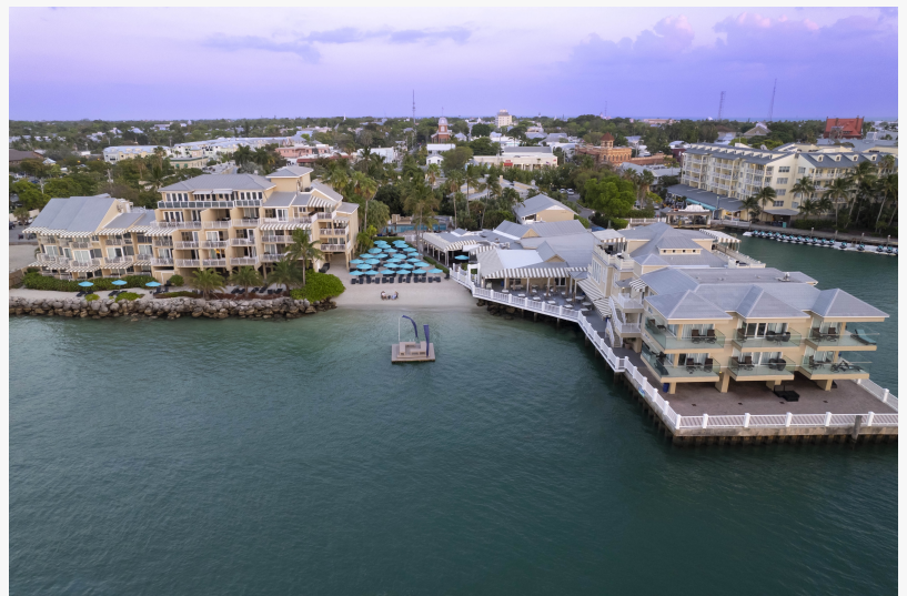
Pier House Resort & Spa in Key West

https://www.pierhouse.com/book-early-and-save