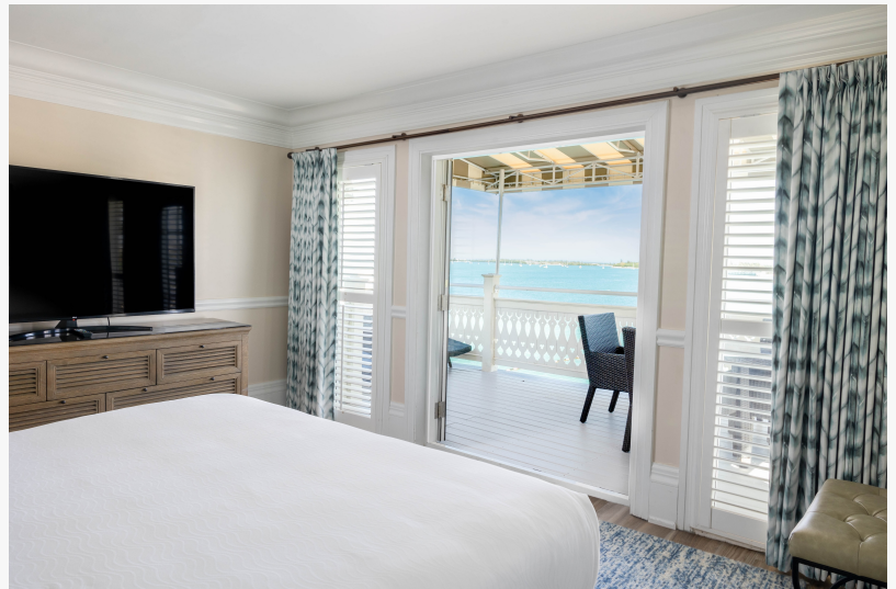
Pier House Resort & Spa Suite