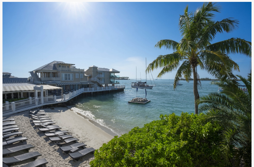
Pier House Resort & Spa