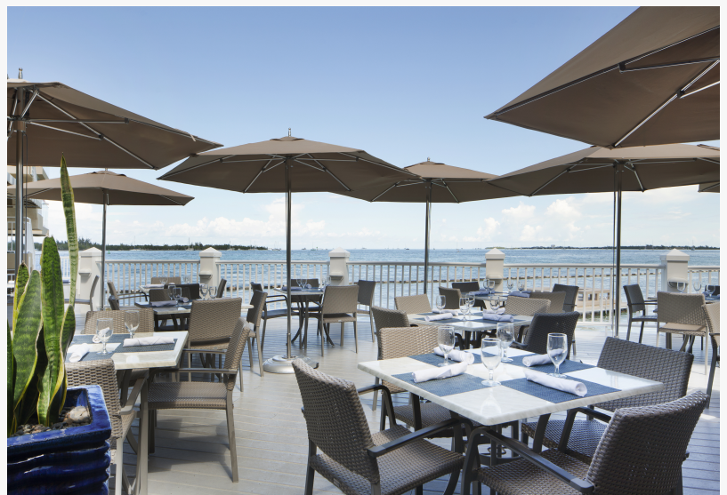
One Duval at Pier House

Offering 119 guest rooms and 23 suites, Pier House Resort & Spa presents gorgeous grounds while boasting stunning views. For more information about Pier House Resort & Spa call (305)-296-4600. Visit www.pierhouse.com or find information on Facebook and Instagram.