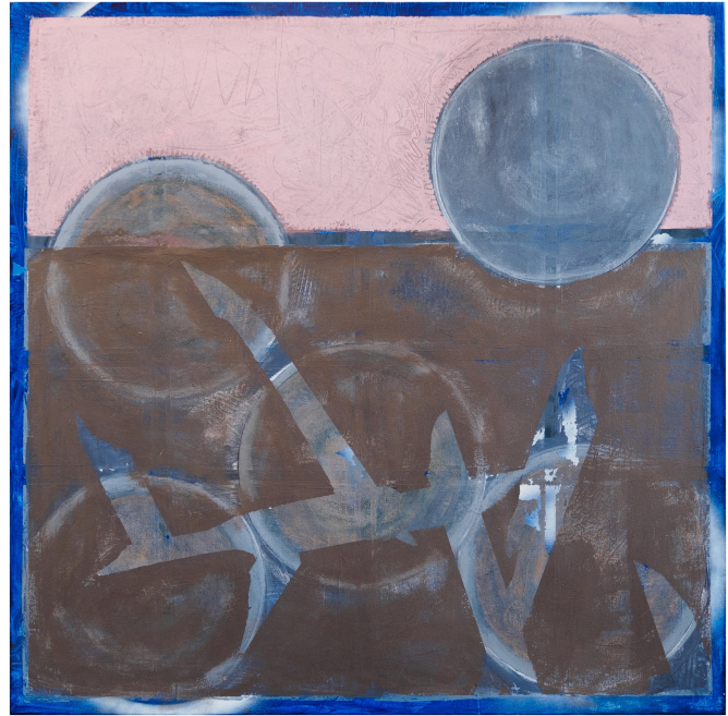
Pink Horizon-Blue Moon: 40" x 40" acrylic and spray paints, inks, and stencils on canvas

This press release can be viewed online at: https://www.einpresswire.com/article/811947446