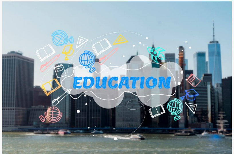
PEL Learning Center franchise