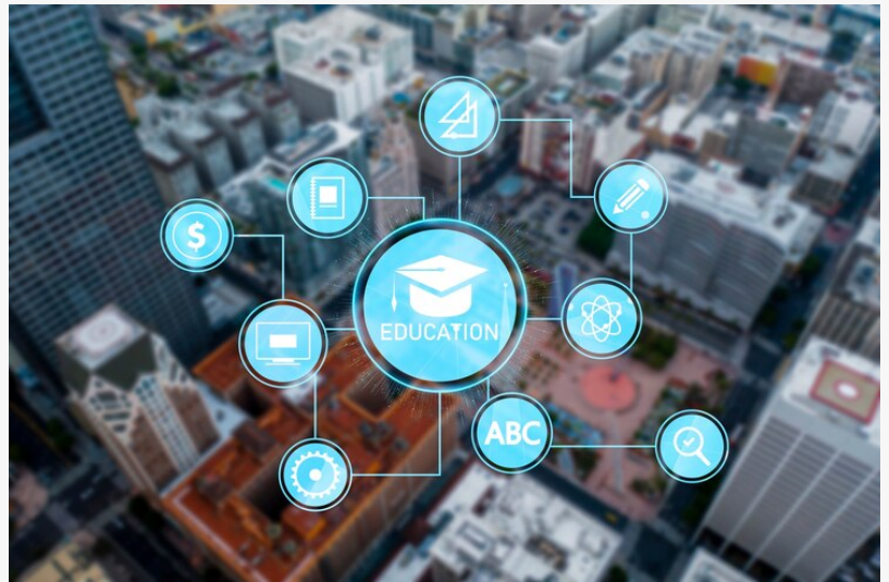
PEL Learning Center 1