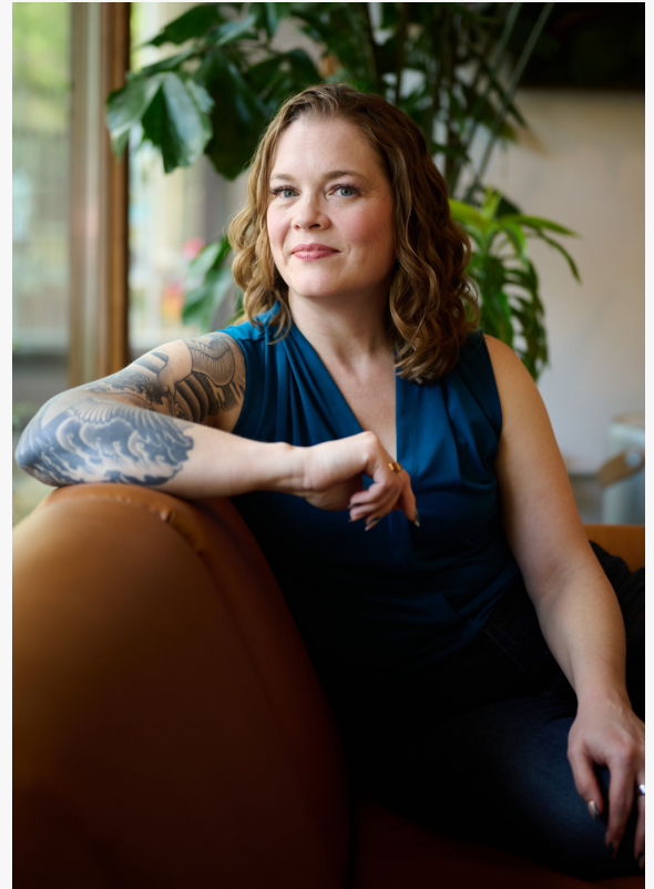
Author Sara Lobkovich.