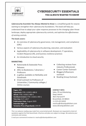
GALLEY BACK COVER

Galley cover of Cybersecurity Essentials You Always Wanted to Know by Vibrant Publishers